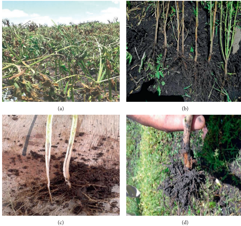
FIGURE 3: Field work sample pictures showing disease severity and symptom. (a) Fusarium wilt symptom on leaves. (b) Fusarium wilt symptom on the external stem. (c) Fusarium wilt systemic symptom. (d) Symptom on a root.