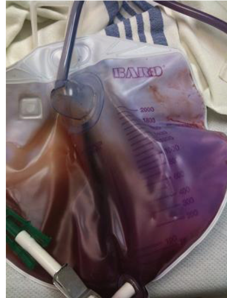
FIGURE 2: Purple discoloration of the urine with similar changes in the urine bag and tubing.

Upon further questioning, it was revealed that the patient had the purple urine since the last 1 year. The patient had a history of recurrent urinary tract infections (UTIs) with multiple bacteria in the past. Based on these facts he was