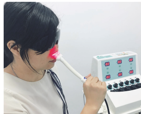
FIGURE 2: A patient receiving red light rhinophototherapy through two light-emitting nasal probes.

from RLRPT were asked via telephone communication 2 days later. Patients in the active control group were medically treated with an intranasal steroid (mometasone furoate nasal spray, 4 sprays, once a day), along with an oral antihistamine (levocetirizine 5 mg qd). Telephone calls were placed 2 days later in order to evaluate the severity of each patient's rhinitis symptoms, along with any overall change in rhinitis symptoms.