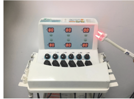
FIGURE 1: Transverse Many Channels Laser Instrument (Transverse, Ind, Co., Ltd., Taipei, Taiwan).

2.2. Study Design. Eligible patients were randomly divided into 2 groups. Randomization assignments were generated by an independent statistician. Patients in the study group were treated with one treatment session of RLRPT (40mW/nostril for 15 minutes) at the outpatient clinic after completing a nasal patency test using both active anterior rhinomanometry and acoustic rhinometry. Upon completing RLRPT treatment, patients took a rest for 30 minutes. They were then asked about the severity of their rhinitis symptoms, and as to whether the overall level of change in those rhinitis symptoms was worse, unchanged, slightly improved, much improved, or cured. Patients were also questioned about any adverse events of RLRPT before undergoing another nasal patency test. Finally, medical treatment involving an intranasal steroid (mometasone furoate nasal spray, 4 sprays, once a day), along with an oral antihistamine (levocetirizine 5 mg qd) was given for continued management of AR. Questions regarding the severity of each patient's rhinitis symptoms, the overall change in their rhinitis symptoms, and any adverse events