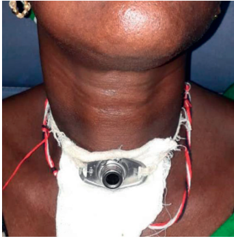
FIGURE 3: Tracheotomy cannula in a patient with recurrent laryngeal papillomatosis.

reported in a patient for whom the tracheotomy could not be performed in time in the event of a recurrence.