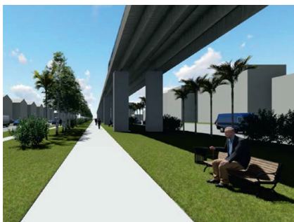
FIGURE 3: Fully immersive virtual reality environment used for balance testing.

AR and no glasses/goggles. The computer scientists who are part of the team and co-authors designed, produced, and coded the AR and VR environments.