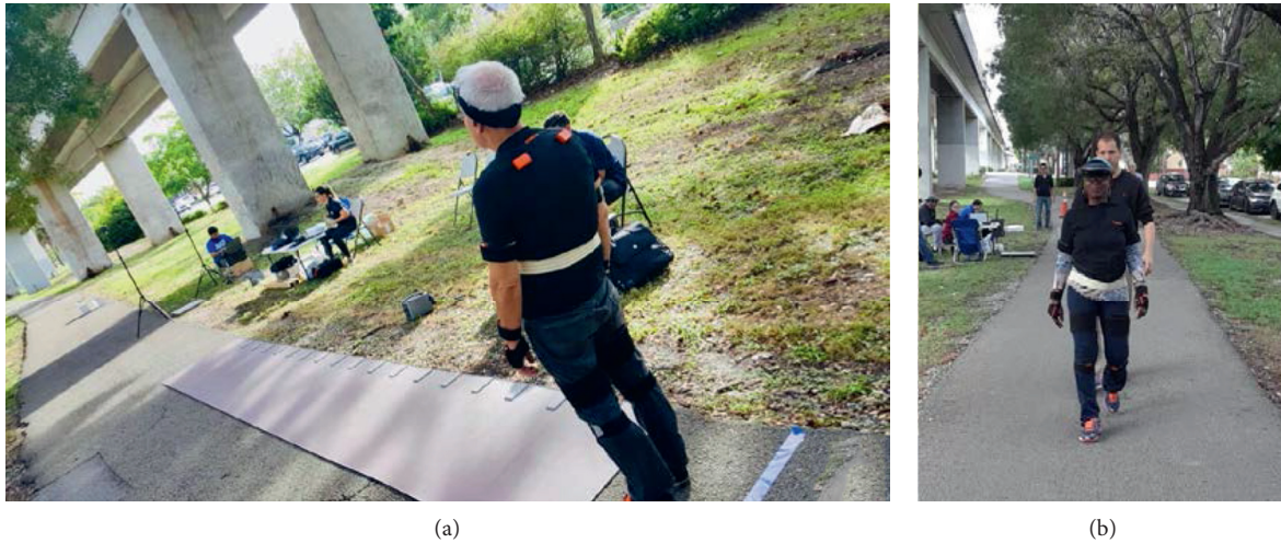
FIGURE 1: Participant at the beginning of the mat before initiating a walking trial (a) and a participant finishing the walk after crossing the mat (b).