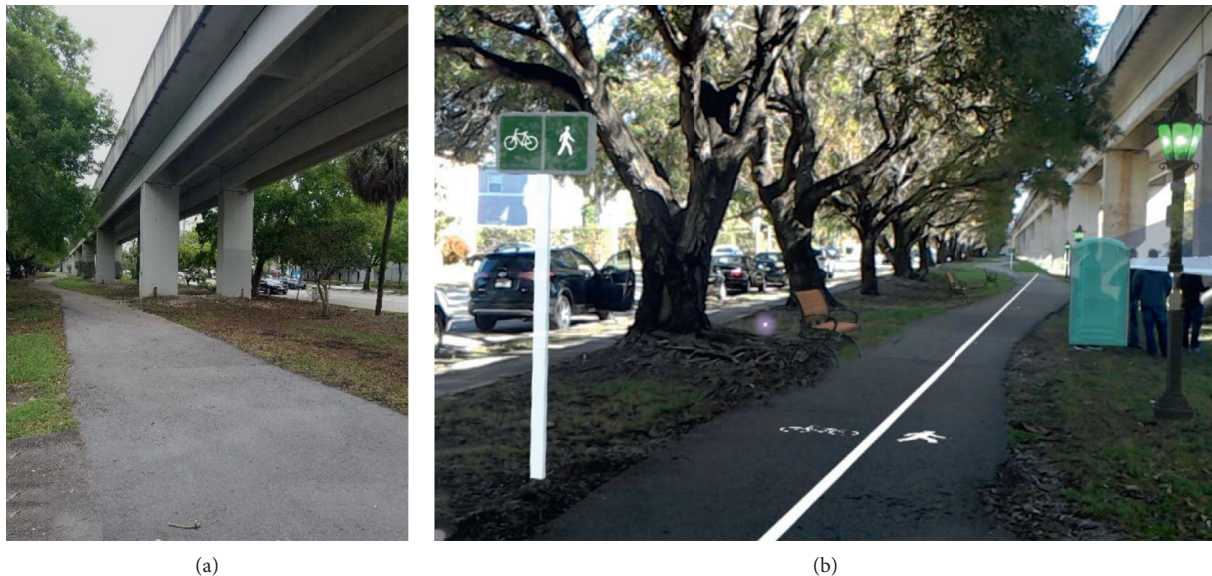
FIGURE 2: Environment not including (a) and including (b) the augmented reality displays of (from right to left) a transparent wall, light fixtures, bathroom, lane separations for bikes and pedestrians, benches, and signage.