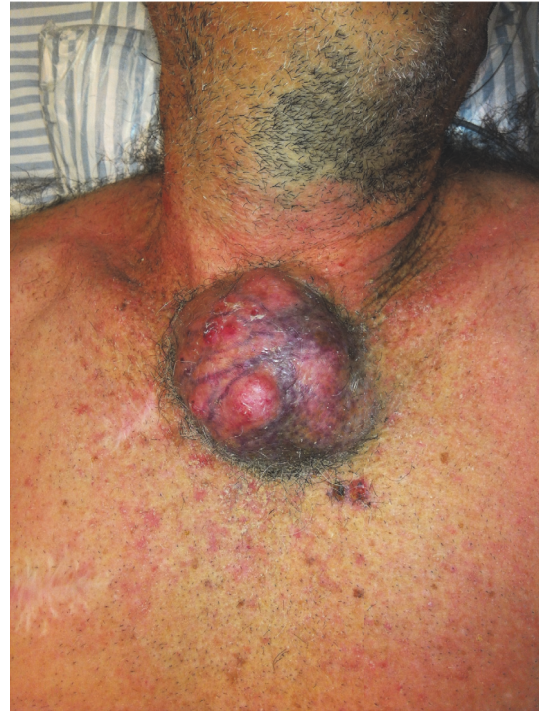
FIGURE 1: Nonmelanoma Skin cancer on sternal region, invading ribs, clavicles, and manubrium sterni.

The histopathological data confirmed advanced disease, with lesions deeper than 4 cm, invasion of pectoralis muscle