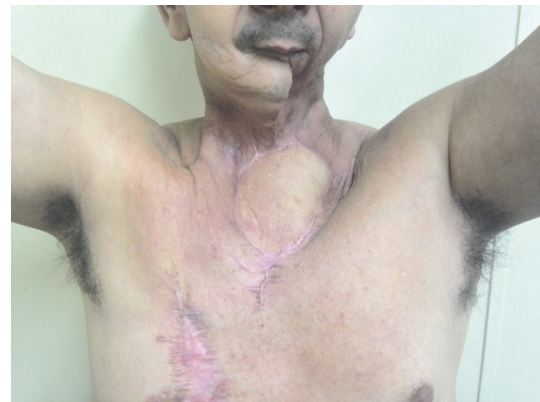
FIGURE 3: Functional preservation of the upper limbs after extended sternectomy and reconstruction with myocutaneous flap.

estimates of incidence rates and expected numbers of new cases in relation to this cancer should be considered as minimum estimates [3, 4]. According to Brazilian National Cancer Institute, it is estimated that there will be 85.170 and 80.410 new cases of nonmelanoma skin cancer in men and women annually, respectively, by 2018 and 2019 in Brazil [3, 4]. Skin squamous cell carcinoma is the second most prevalent type, after the basal cell type. Solar radiation exposure is the main risk factor for SSCC and BCC, both more prevalent in tropical regions: 75% occur in areas around the face and neck, in fair-skinned and older people [5]. In Ceara state, in the northeast