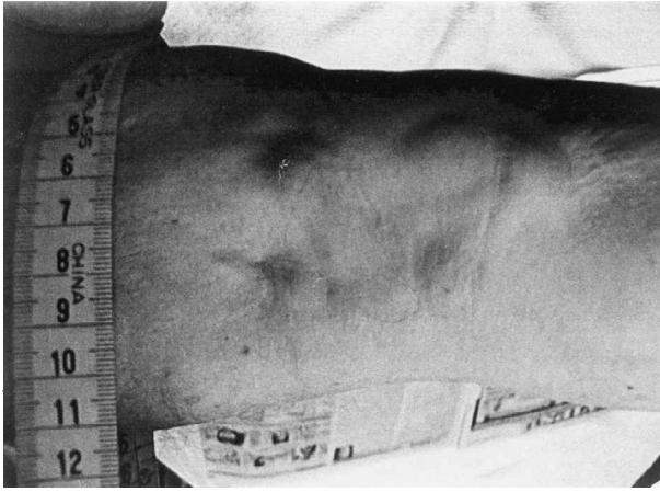
Fig. 1. Macroscopic aspect of the multinodular sclerotic lesion fixed to the skin at the elbow region (forearm is to the right). This appearance remained identical during 16 years after the extravasation and then suddenly changed.