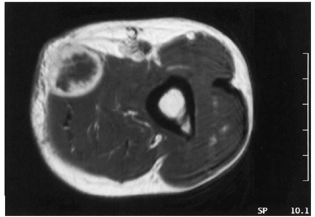
Fig. 2. Transverse section of MRI image just above the elbow. The tumour enhances peripherally with central necrosis.

struction of the lateral chest wall was carried out with a Vicryl mesh.