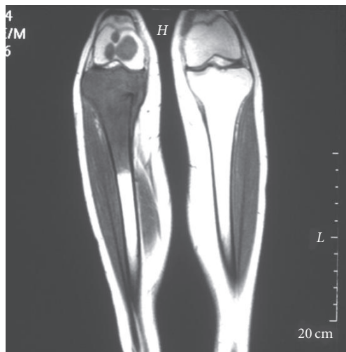
FIGURE 2: MRI right leg, showing osteosarcoma of proximal tibia with further lesions in the distal femur.