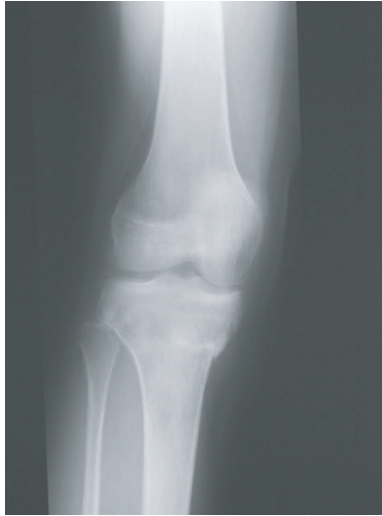
FIGURE 1: Pathological fracture of right proximal tibia.