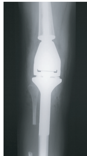
FIGURE 4: Postoperative x -rays showing prosthetic replacement.

of tumour, which was thought to rule out haematogenous metastasis. More recently, the report of cases related to p53 mutations [10] and retinoblastoma [11] might suggest a possible mechanism for multiple primary tumours.