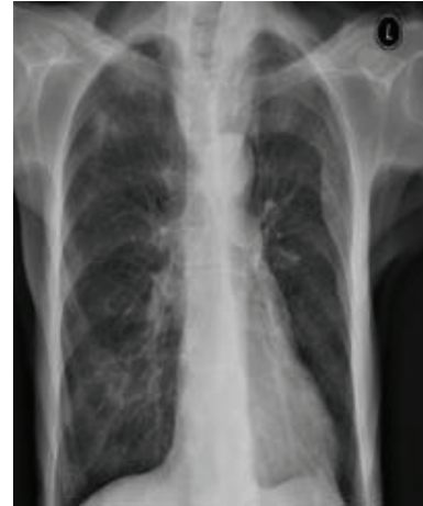
FIGURE 3: Repeat chest radiograph performed three months later showing a significant reduction in size and number of lung metastases.

There has been an increased incidence of soft tissue sarcomas in breast cancer patients who underwent radiotherapy