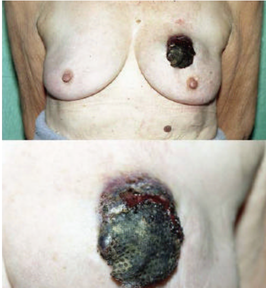
FIGURE 1: An ulcerated bruise-like lesion in the left breast, consistent with the typical appearance of a breast angiosarcoma.