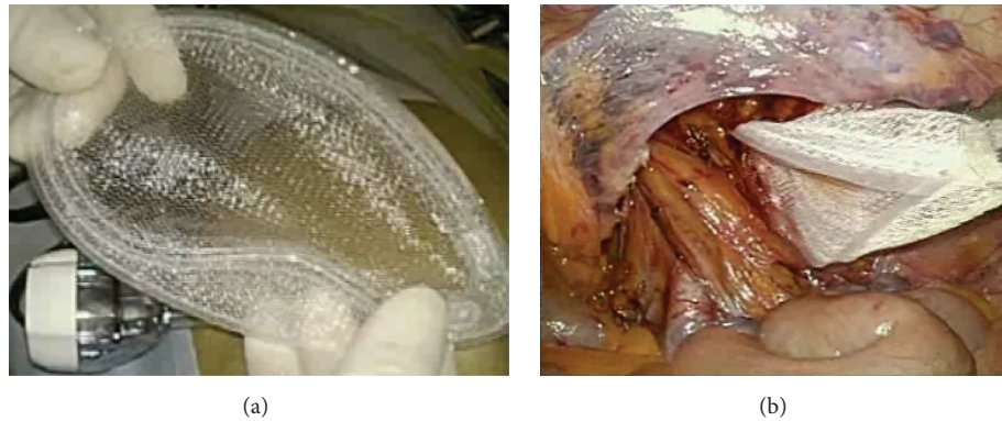
FIGURE 1: Polysoft mesh with the memory-ring (a). The mesh can be inserted into the abdominal cavity via a 12 mm port. Turning down the mesh in a dog-ear fashion using the interruption of the memory-ring (b).

performed by placement of a mesh into the preperitoneal space. However, the use of Polysoft mesh for transabdominal preperitoneal (TAPP) hernia repair has not been reported previously. We report the results of a study evaluating the feasibility, safety, and effectiveness of TAPP inguinal hernia repair using Polysoft mesh.