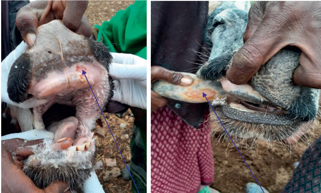
FIGURE 1: Gum and tongue lesion observed on cattle infected with foot and mouth disease.

2.9. FMD Viral RNA Extraction and PCR Amplification. Total RNA was extracted from collected FMD-suspected clinical sample suspension using Qiagen RNA extraction kit following the manufacturer's instructions as [27]. Briefly, 140 microliters of sample suspension was added to 560 \mu l buffer AVL carrier RNA in the microcentrifuge. The tubes were briefly centrifuged to remove drops from the inside of the lid. Then, 560 \mu l of ethanol (70%) was added to the sample and mixed by pulse vortexing for 15 seconds followed by centrifuging to remove drops from the inside lid. Then, 630 \mu l of the solution was applied to the QIAMP Minispin column in a 2 ml collection tube and centrifuged 12,500 rpm for 1 min. The filtrate was discarded, and the column was placed in a fresh 2 ml collection tube. Then, 500 \mu l of buffer AW2 were added and centrifuged at 12,500 rpm for three min and the filtrate was discarded. Next, 65 \mu l of Buffer AVE was added to the column equilibrated at room temperature for one min and centrifuged at 12,500 for 1 min. Using reverse transcription polymerase chain reaction (RT-PCR) and specific primers set FMDV7-forward (FMDV7F) and FMDV7-reverse (FMDV7R) as depicted in Table 1, extracted RNA samples were detected for the presence of FMDV.