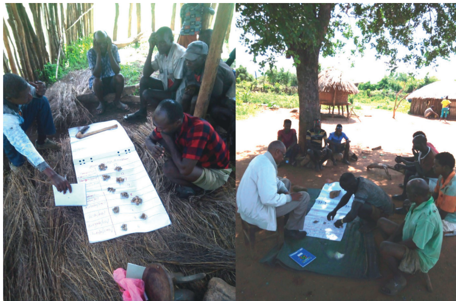
FIGURE 2: Active participation of group members.